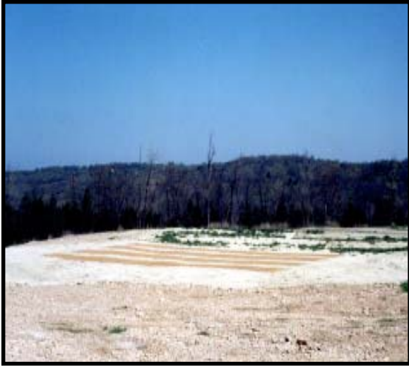
Figure 3. BRMTS in April 2000.