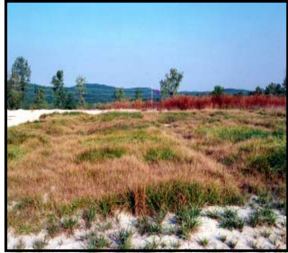
Figure 4. BRMTS in September 2000.

some of the metals. Concentrations of plant-available Cd and Zn in samples of Milorganite treatment plots were similar to those in samples of the control plots, indicating that Milorganite did not change the availability of these metals.