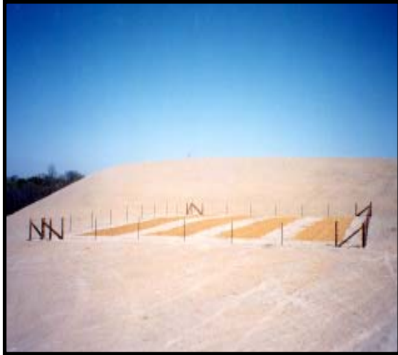
Figure 5. LCTS in April 2000.