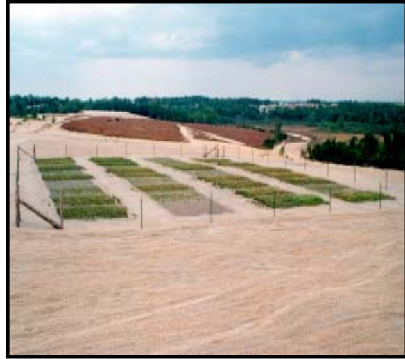
Figure 6. LCTS in September 2000.

below the \geq 50\% cover criteria established in the QAPP, except for the St. Peters compost high application rate. Milorganite was less effective than the two compost treatments. Ormiorganics compost resulted in somewhat lower production than the St. Peters compost. In general, both cover and production were correlated with increasing application rates for all treatments. Production increased with increasing organic amendment application rates for the Milorganite and both compost treatments; however, that correlation was not as linear as for St. Peters compost.