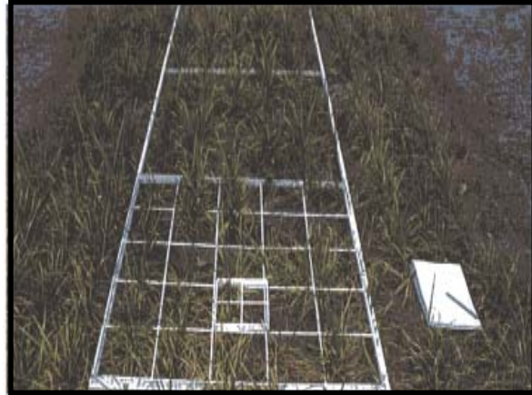
Figure 2. Grid system used for vegetation analysis.