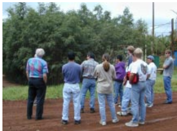
Figure 4. (Left) Students observe the microbes that “do the work” in bioremediation. (Right) Students visit a phytoremediation treatment unit being used to remediate a pesticide-contaminated aquifer.

are also being carried out at the secondary and college level. As part of a senior engineering design class in the biosystems engineering department, students design novel systems of utility for real-life problems. One example of a bioremediation-related project is the design of a biofilter for the treatment of fumes from a painting facility. The student identified the composition of the fumes traveling through the system, how they degraded, what remained, and designed a biofilter to trap and treat the products.