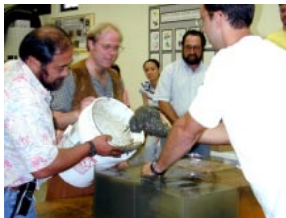
Figure 3. (Left) Teachers learn about research projects being done at the University of Hawaii. (Right) Teachers assemble a natural waste treatment system using plants, rocks, and mud.

Hawaii. The two courses differ in their audience; one course was developed for elementary, middle and high school teachers, and the other for students pursuing engineering careers. The class for teachers includes field trips to bioremediation projects; classroom activities on composting, oil spill bioremediation, water testing, and building model ecosystems that can break down wastes; and guest speakers who lecture on soils, microbes, plants, natural history of the islands, and traditional Hawaiian practices that crossover with the principles of bioremediation (Figure 3). The objective of the class is to train teachers to incorporate a project and/or activities, related to bioremediation, into their classrooms. A network of teachers is developed during the summer session, and teachers may use each other and speakers from the class as resources when needed. The class concludes at the end of the school year, when teachers present (sometimes with their students) their projects and other activities that they have done throughout the year to their peers and other faculty and industrial partners. During this