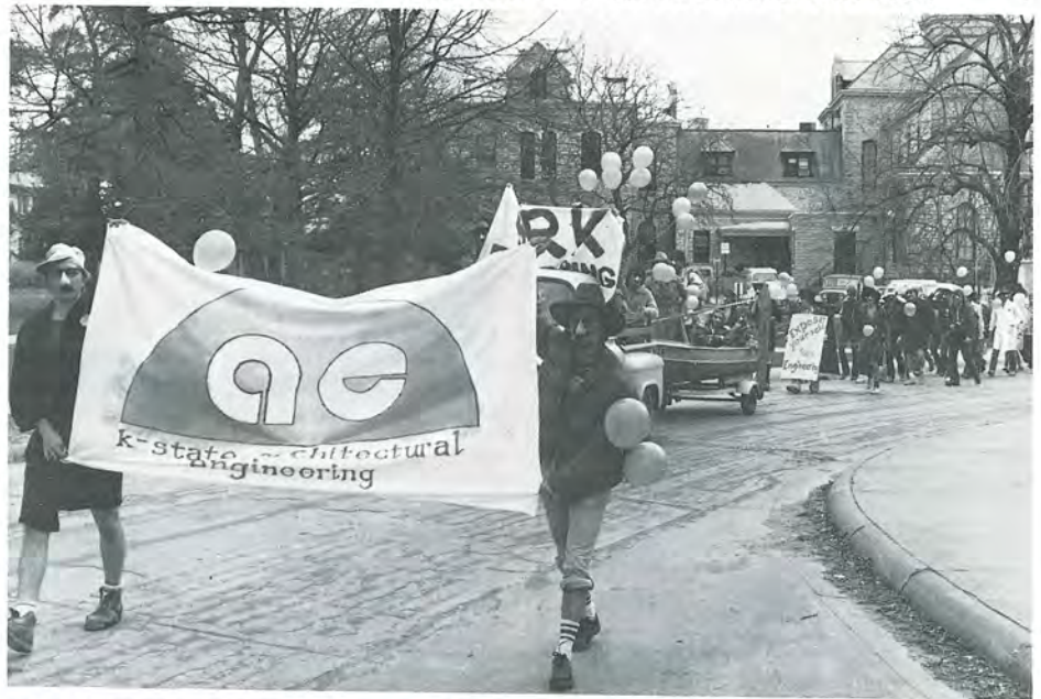
Architectural Engineering students did some clowning during the open house parade. Leading the parade are