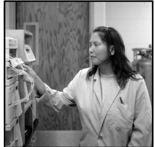
Wendy Griswold/Earth Medicine

Salt examines test results for levels of contaminants in soil.