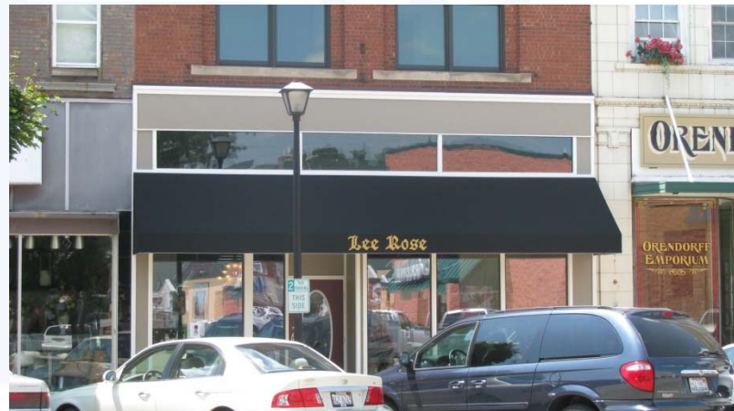
Façade Repair - Canton