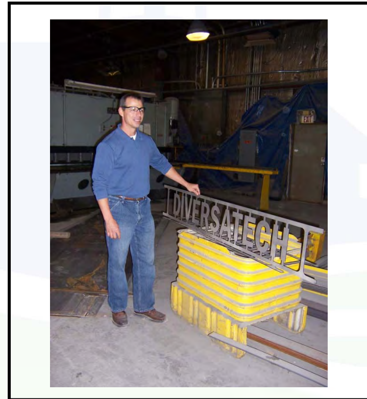
Diversatech, Gridley, IL