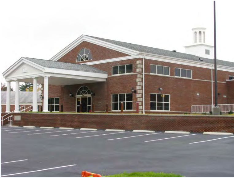
Salem Township Hospital Salem, IL