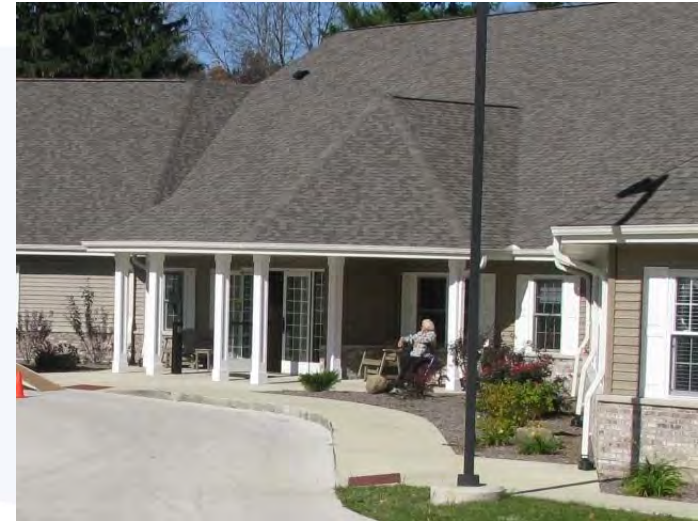
Piatt County Supported Living Facility