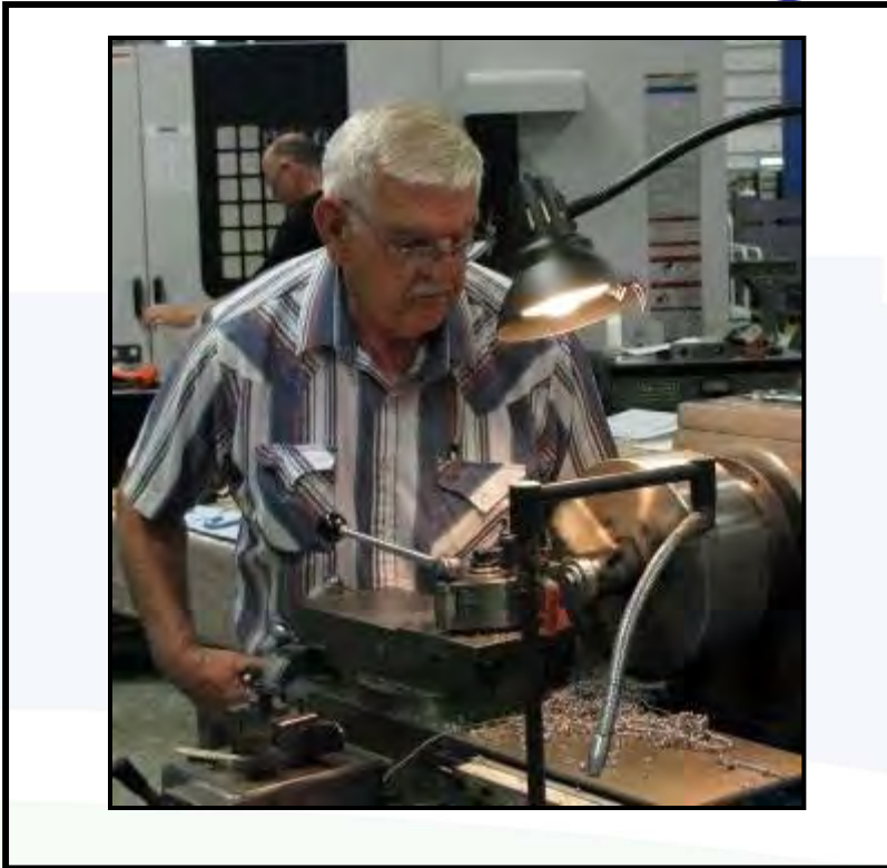
Bale Band-It, Pittsfield, IL