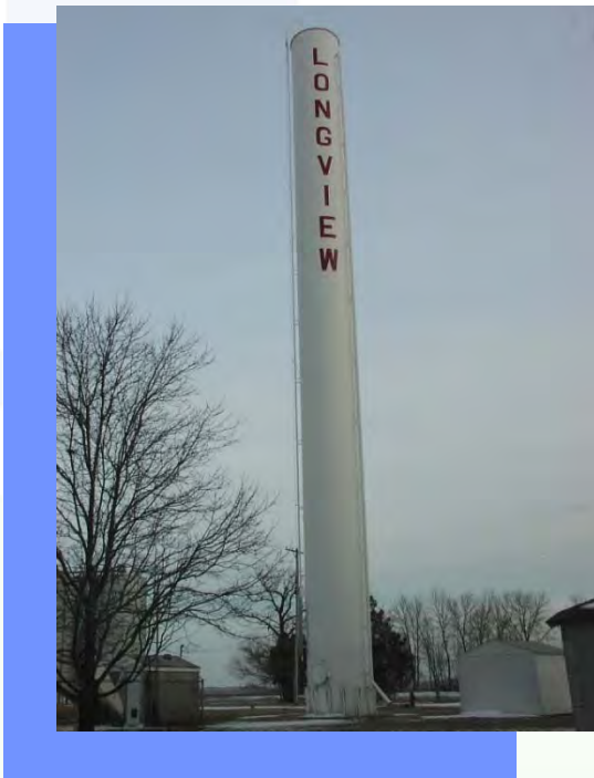
Village of Longview, IL