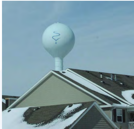
West Prairie Water District Arcola, IL