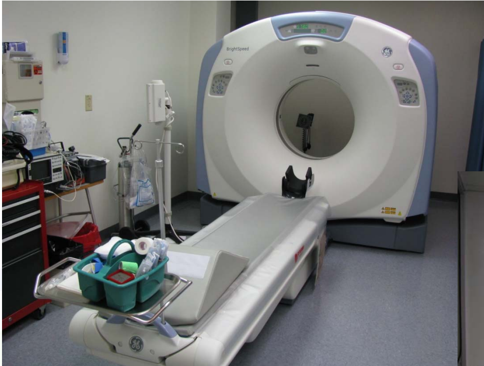
CT scanner Hardin County Hospital