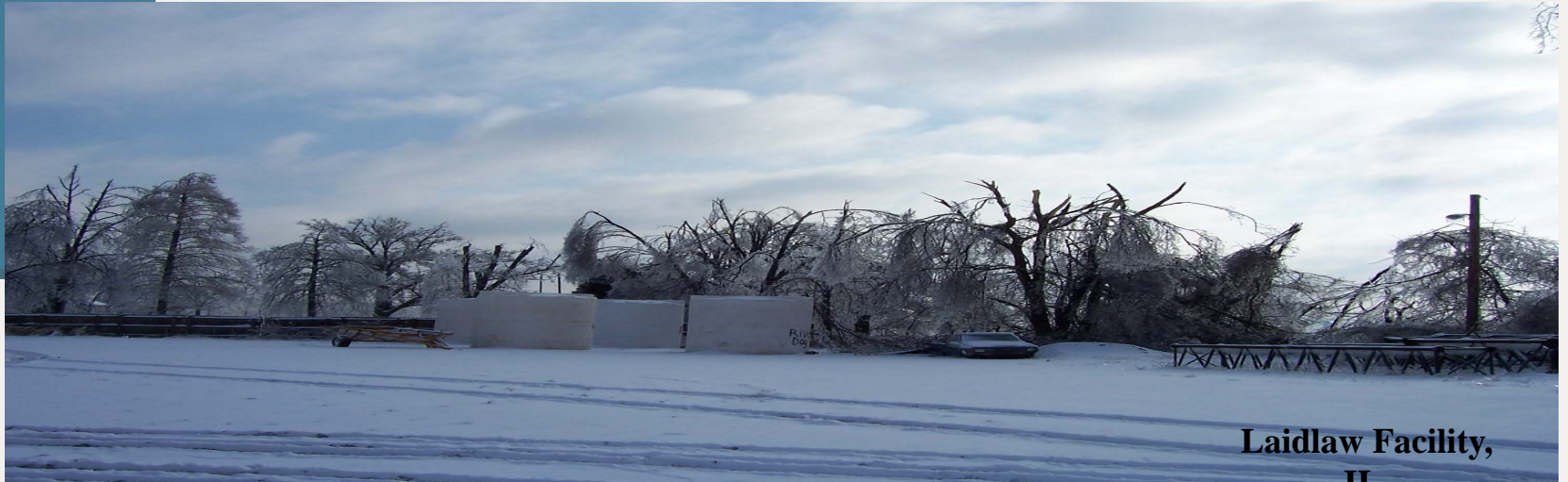
Laidlaw Facility, IL