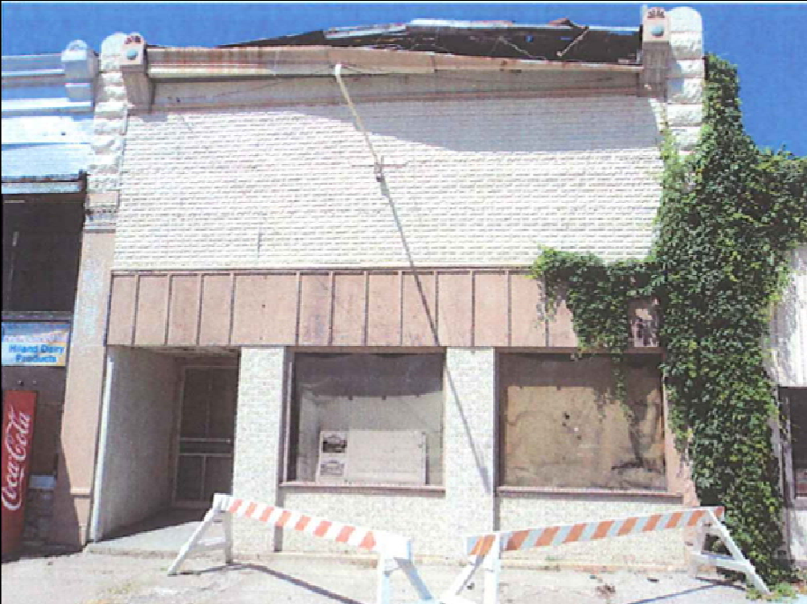
City of Riley Awarded 15K Brownfields Grant to Abate Asbestos