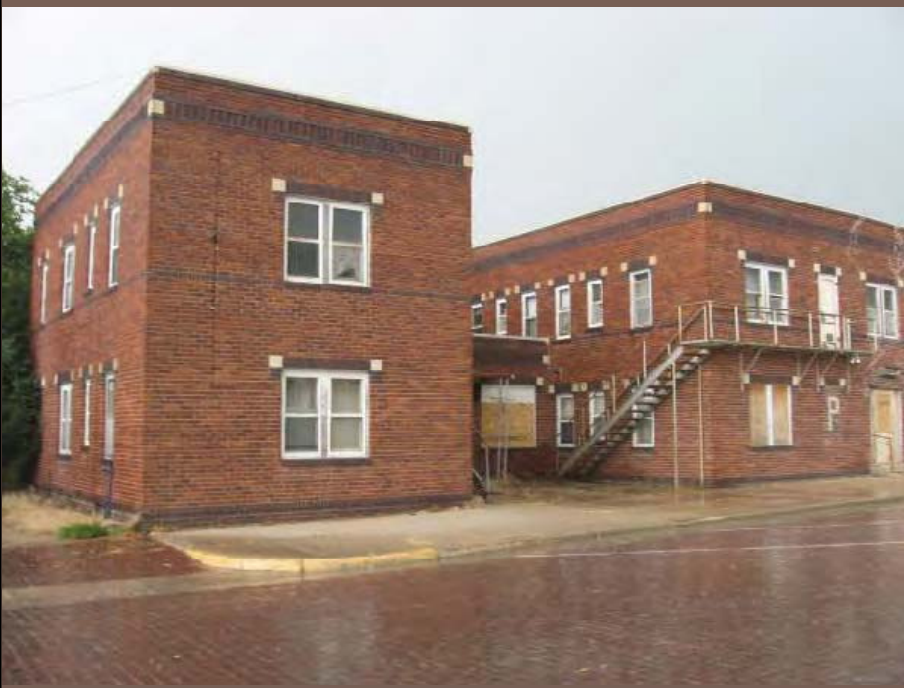
Smith Center Awarded 15K for Asbestos Abatement