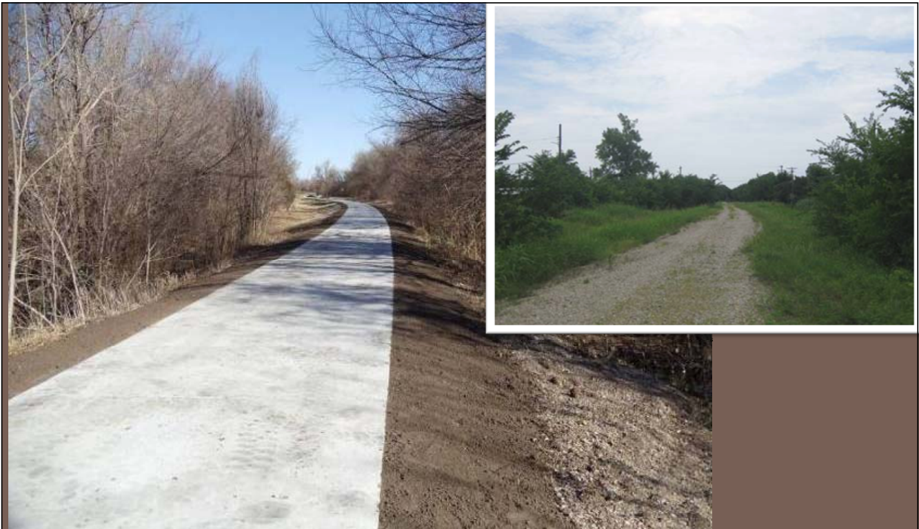
City of Wichita Awarded 200K to Cover Contaminant Soil

Our Vision – Healthy Kansans living in safe and sustainable environments