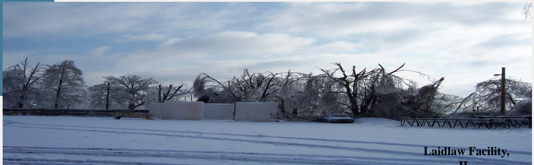
Laidlaw Facility, IL