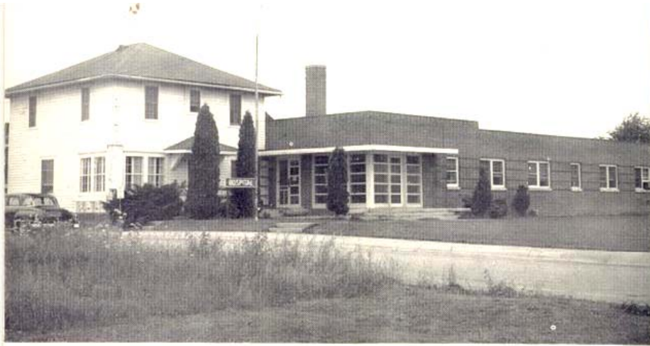
COMMUNITY HOSPITAL, BREMEN, INDIANA—"A GOOD TOWN"