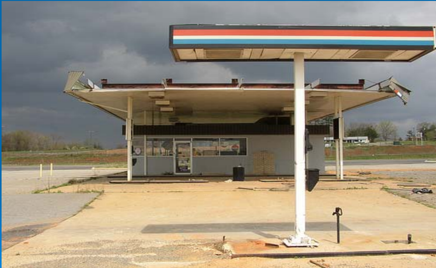
Abandoned Service Station