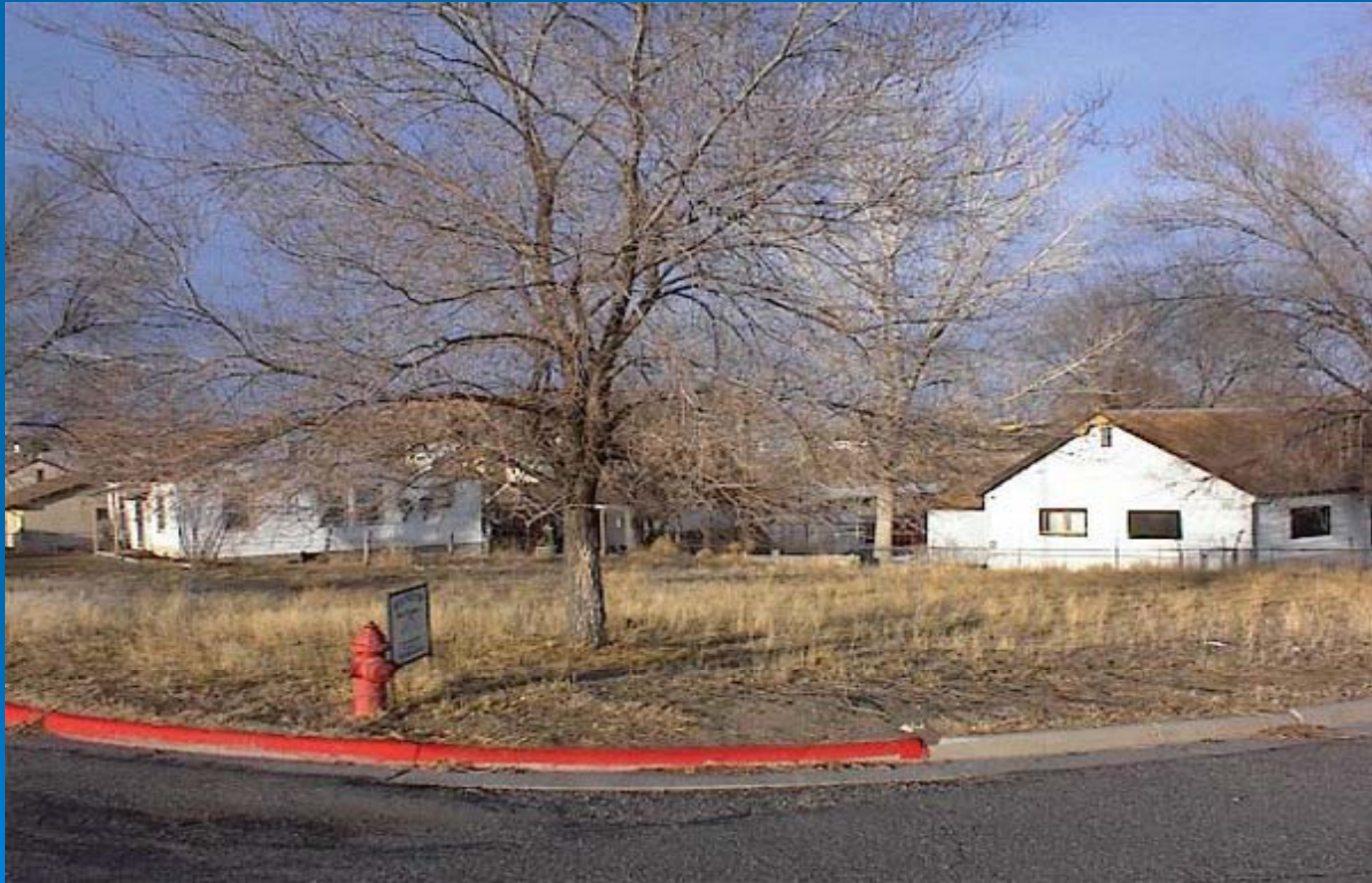
Abandoned Residential Lot