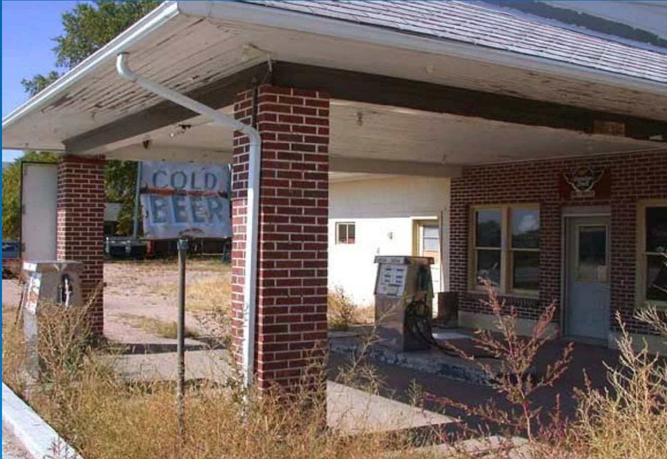
Abandoned Service Station