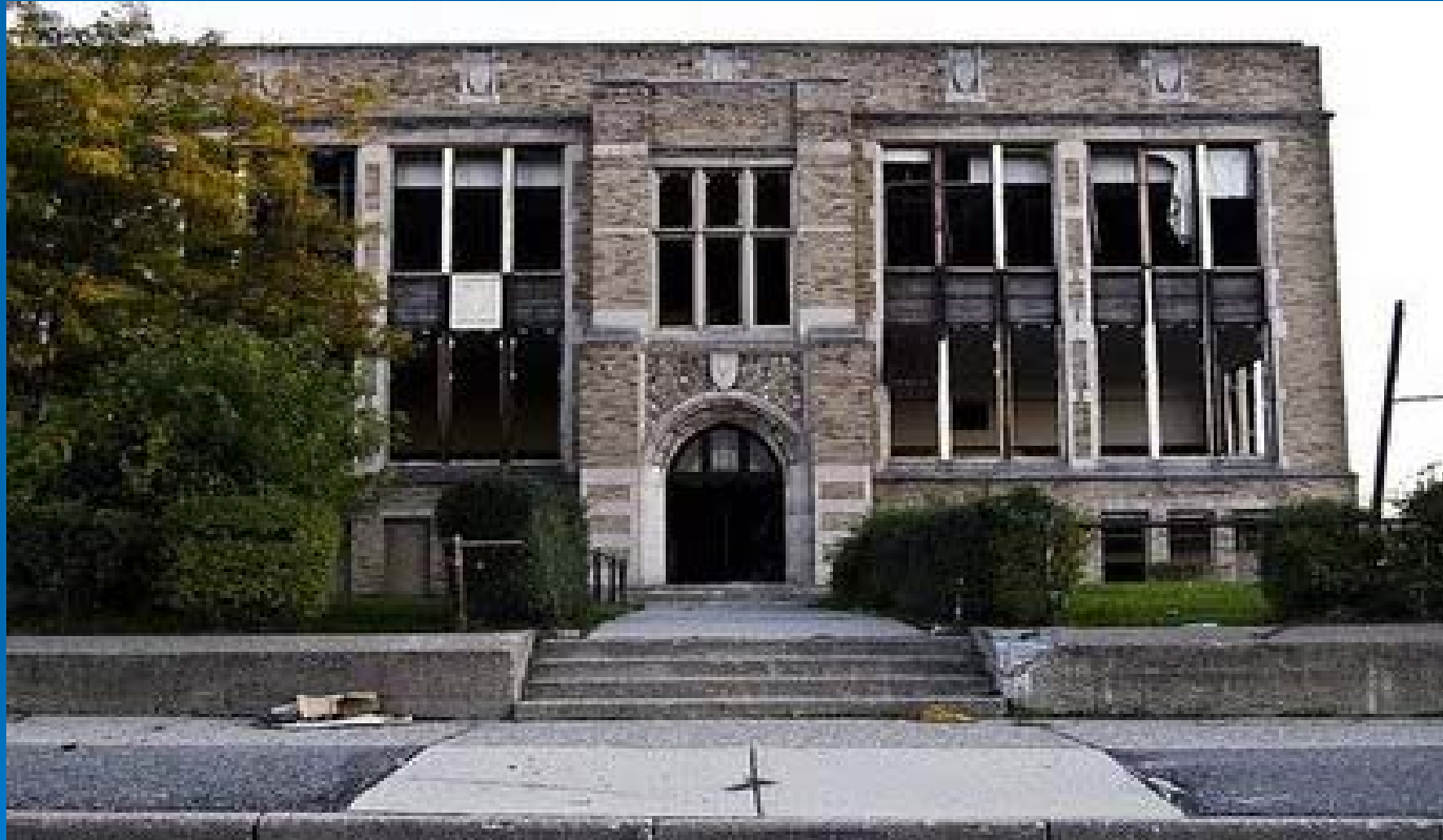
Abandoned School Building