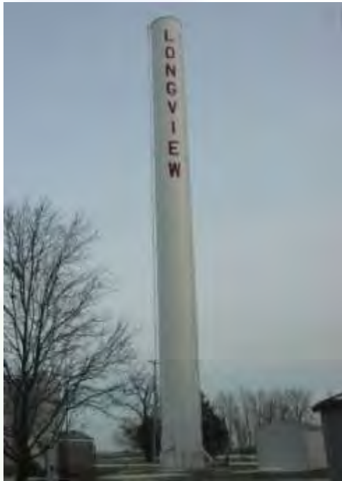
Village of Longview, IL