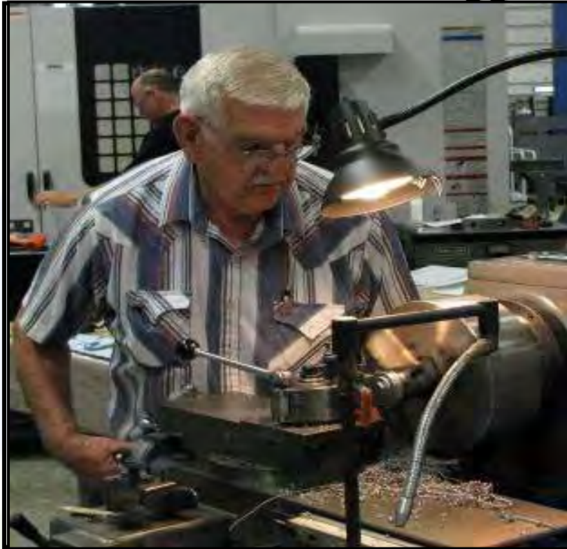
Bale Band-It, Pittsfield, IL