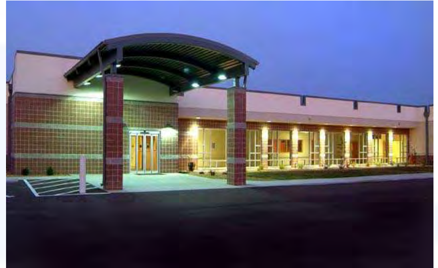
I-70 Community Hospital Sweet Springs, MO