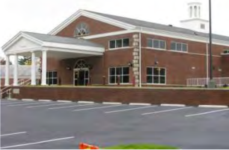
Salem Township Hospital Salem, IL