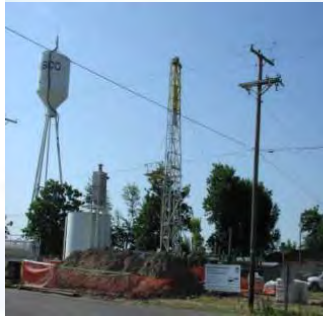
City of Risco, MO