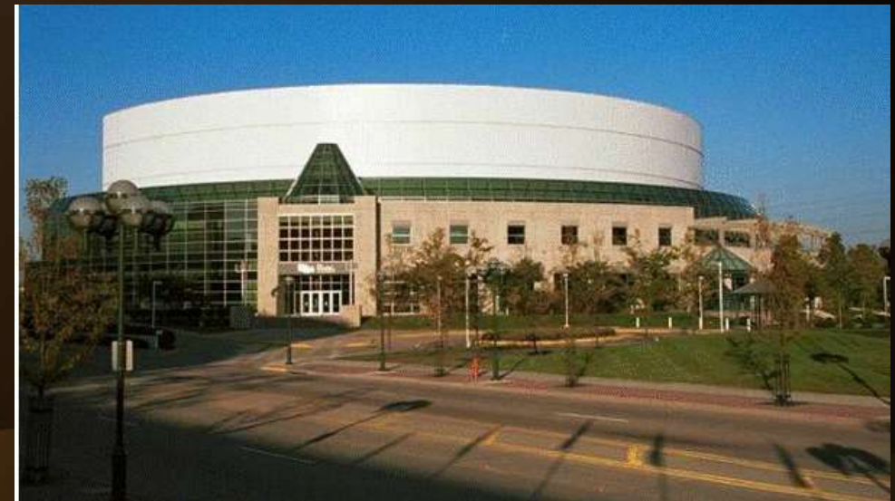
Brownfield redevelopment in Moline, IL