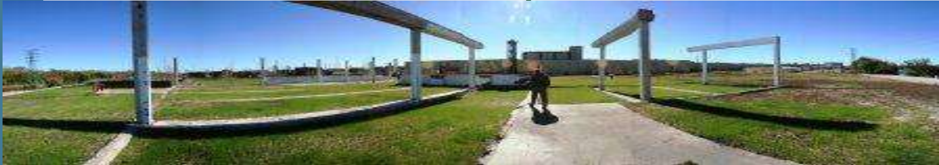
Former Midway Oil Company in Rock Island, IL cleaned up with Brownfields Grant

Up to $200K per property to fund the cleanup at no more than 3 sites.