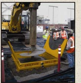
Large Diameter Auger Excavation