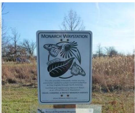
EPA Superfund site Then →