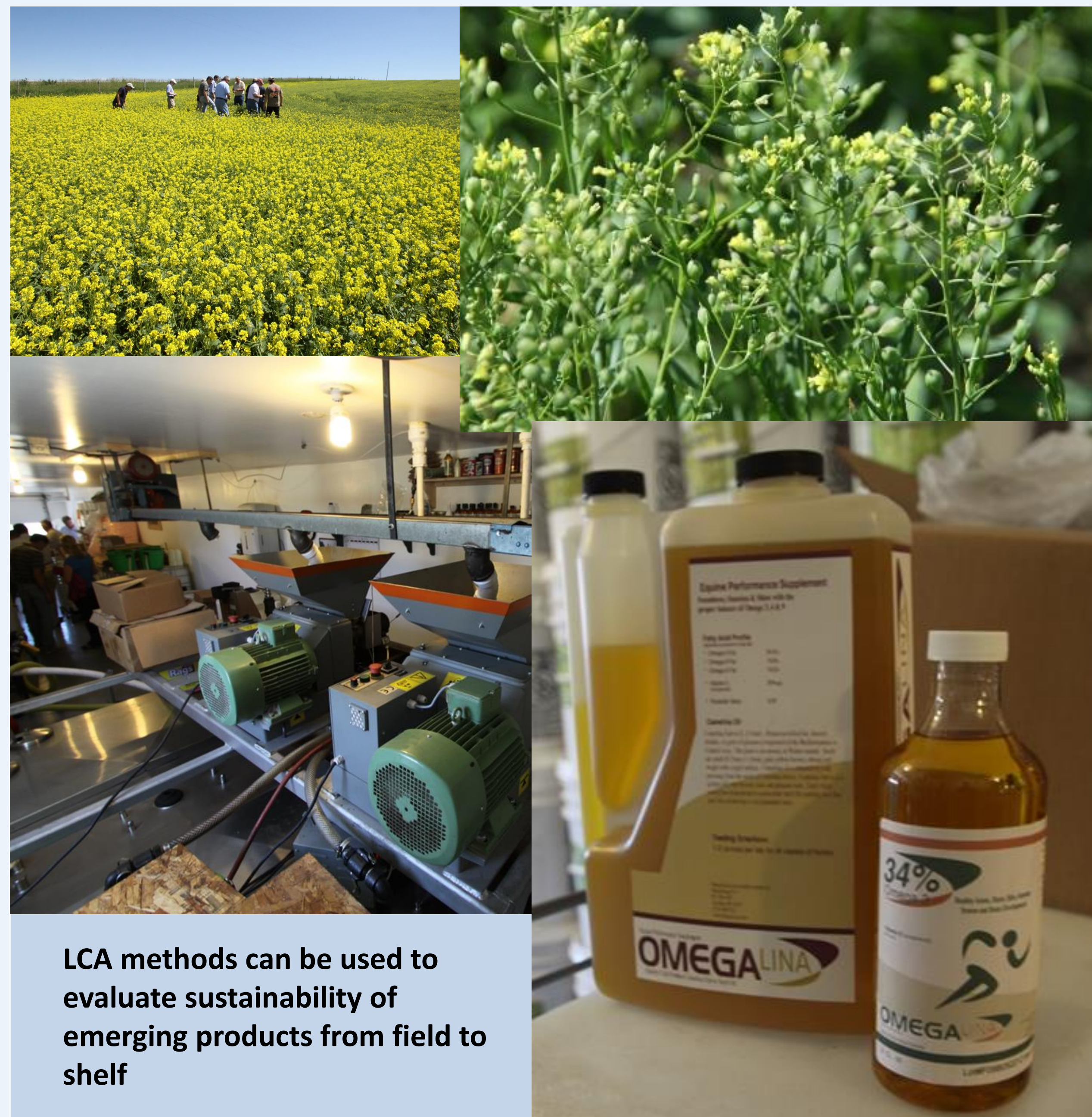
LCA methods can be used to evaluate sustainability of emerging products from field to shelf