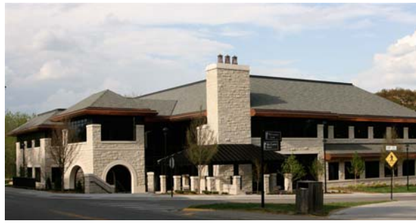
Leadership Studies Building