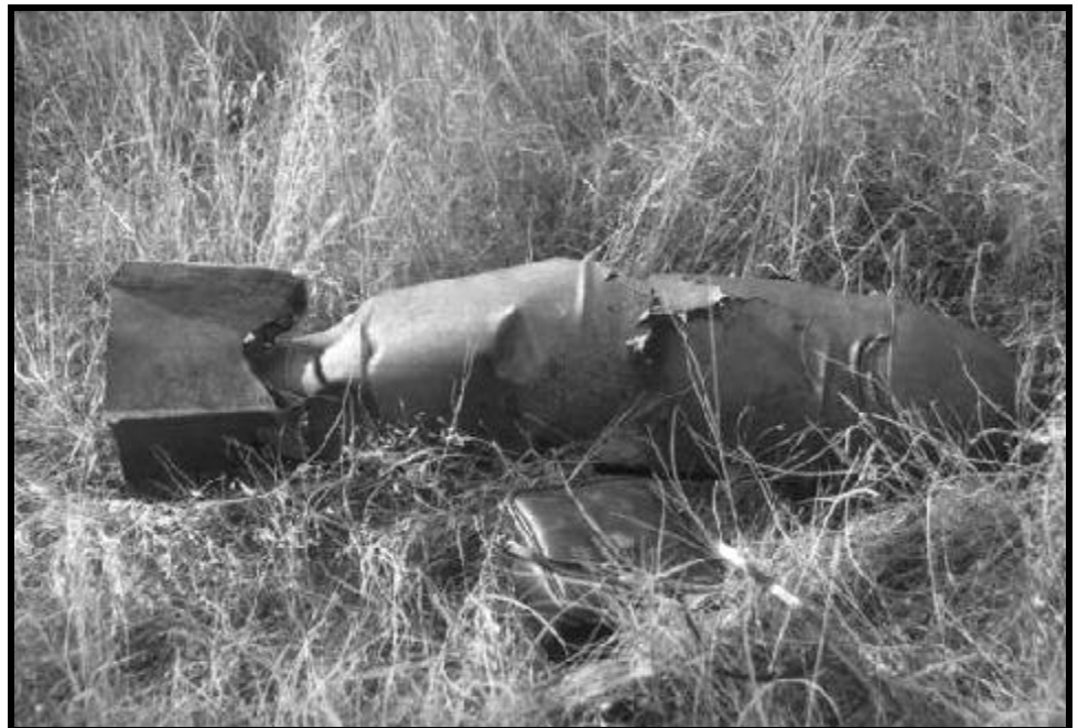
Figure 3. An actual item of UXO (in this case, a bomb) found on the Former Badlands Bombing Range.

NTCRA: Non-Time Critical Removal Action. Removal cleanup action in re-