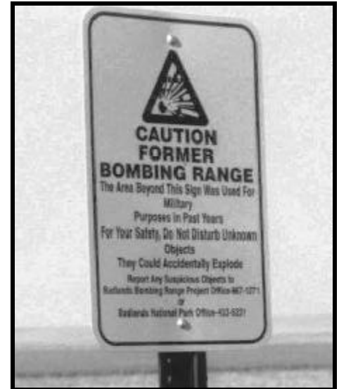
Figure 2. UXO warning sign posted at the Former Badlands Bombing Range in South Dakota.

EE/CA: Engineering Evaluation/Cost Analysis. Prepared for all non-time critical OE removal actions. Determines the extent of a hazard, identifies objectives of the removal action, and analyzes various alternatives that may satisfy the cost, effectiveness, and practicality goals of the removal action.