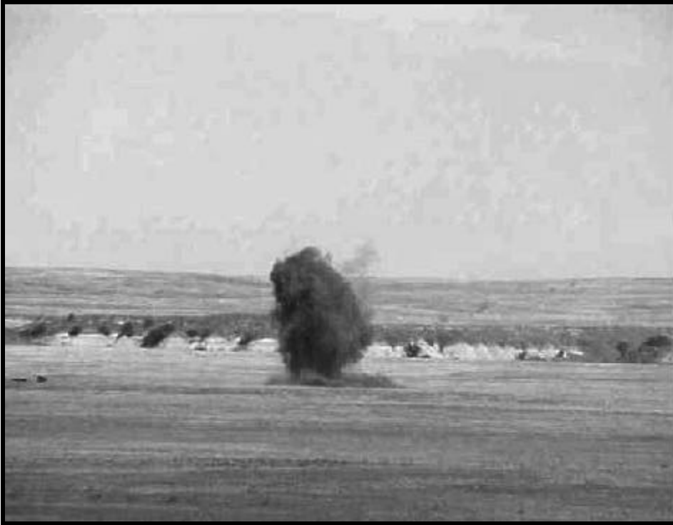
Figure 4. UXO being detonated at the Former Badlands Bombing Range during cleanup of the site.

sponse to a threat to human health or the environment that may be safely delayed for six months or more.